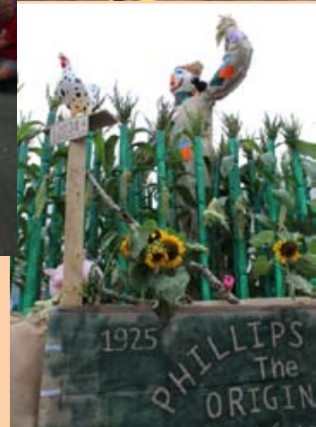
Parade photos